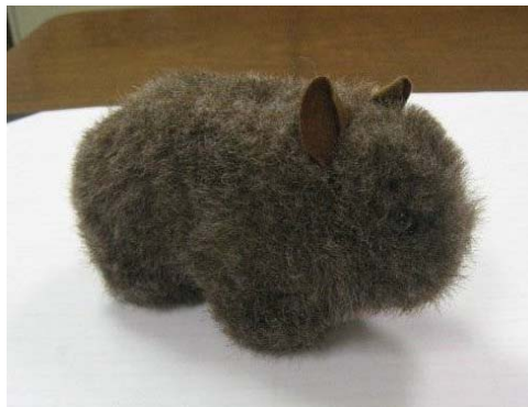
Whammie the Wombat looking composed during a match...

If you wrote a chess book, what would the title be? Wham, Bam, Thank you Ma'am: A Wombat's Guide to Chess .