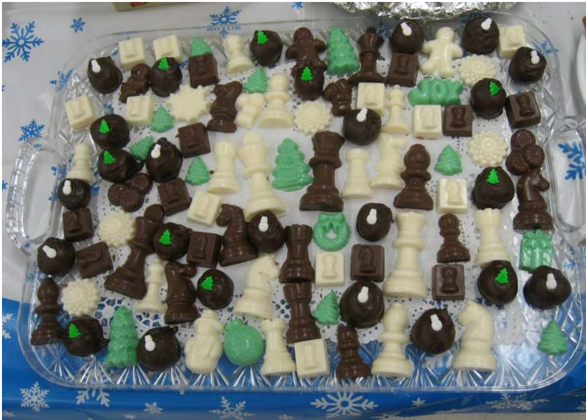
"Chocolate Chess"

The Official Bulletin of the Chicago Industrial Chess League